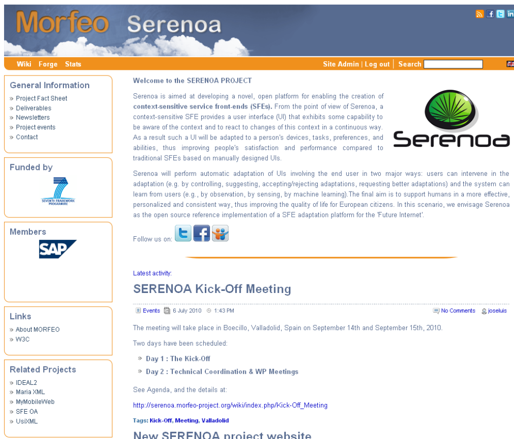
Figure 1 Home page of the Serenoa web site