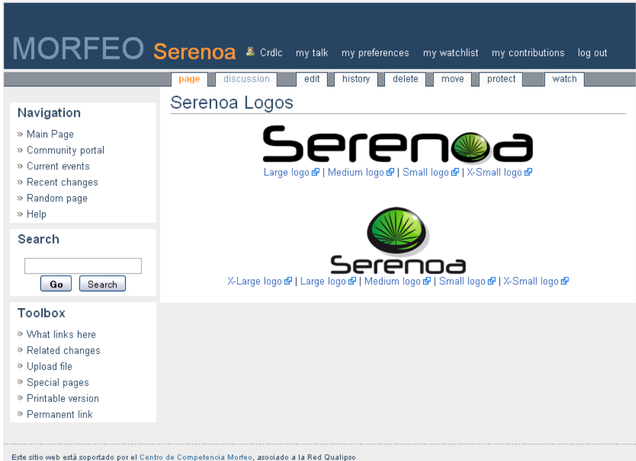
Figure 3 Wiki page for Serenoa logos

The Serenoa web site integrates a Wiki [Figure 3] which allow the project members to easily create informal documents, contributions to deliverables or other materials useful to the consortium (minutes, dussions, etc).