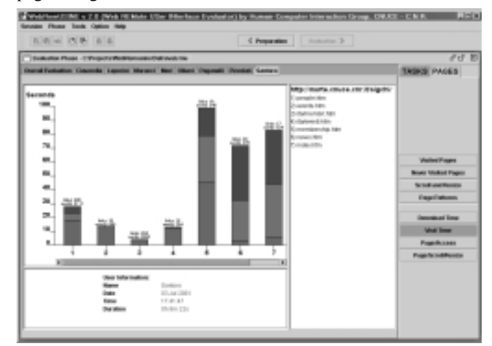
Figure 5: Display of page visit times.

require from the user longer time to identify the required information. The number of links in the page can affect the visit time because users have to consider them to decide how to carry on the navigation. To allow evaluators to better analyse the visit time for each page the tool is also able to provide some measures (number of words and links contained) obtained through a static analysis of the HTML code to determine the complexity of the structure of the page as Figure 5 shows.