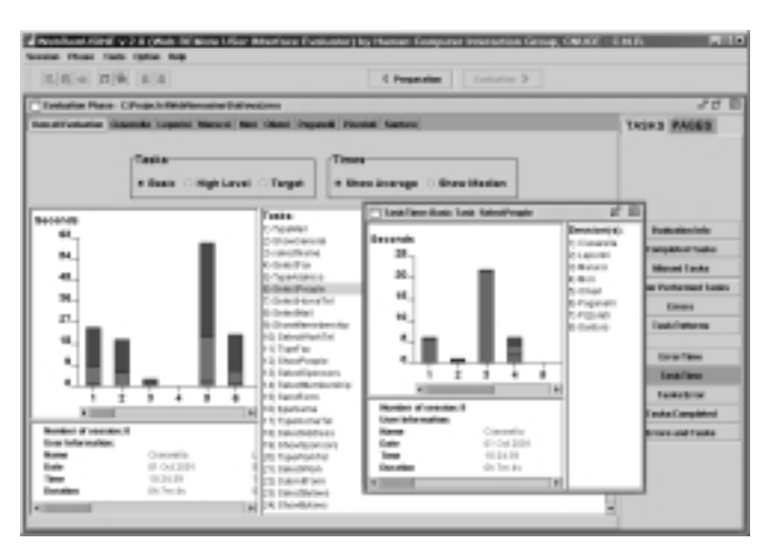
Figure 6: Display of a user group's task performance.